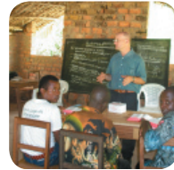
Teaching the Bible in DR Congo.