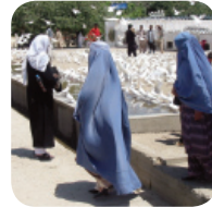
Sharing real hope in South Asia.