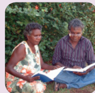
Bible translation in the Northern Territory.