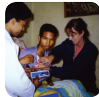
Health training in Nepal.