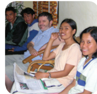
Teaching theology in Indonesia.